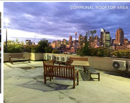
COMMUNAL ROOFTOP AREA

UNDER OFFER, NO FURTHER INSPECTIONS, MORE WANTED OTHERS AVAILABLE