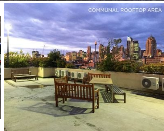
COMMUNAL ROOFTOP AREA

UNDER OFFER, NO FURTHER INSPECTIONS, MORE WANTED OTHERS AVAILABLE