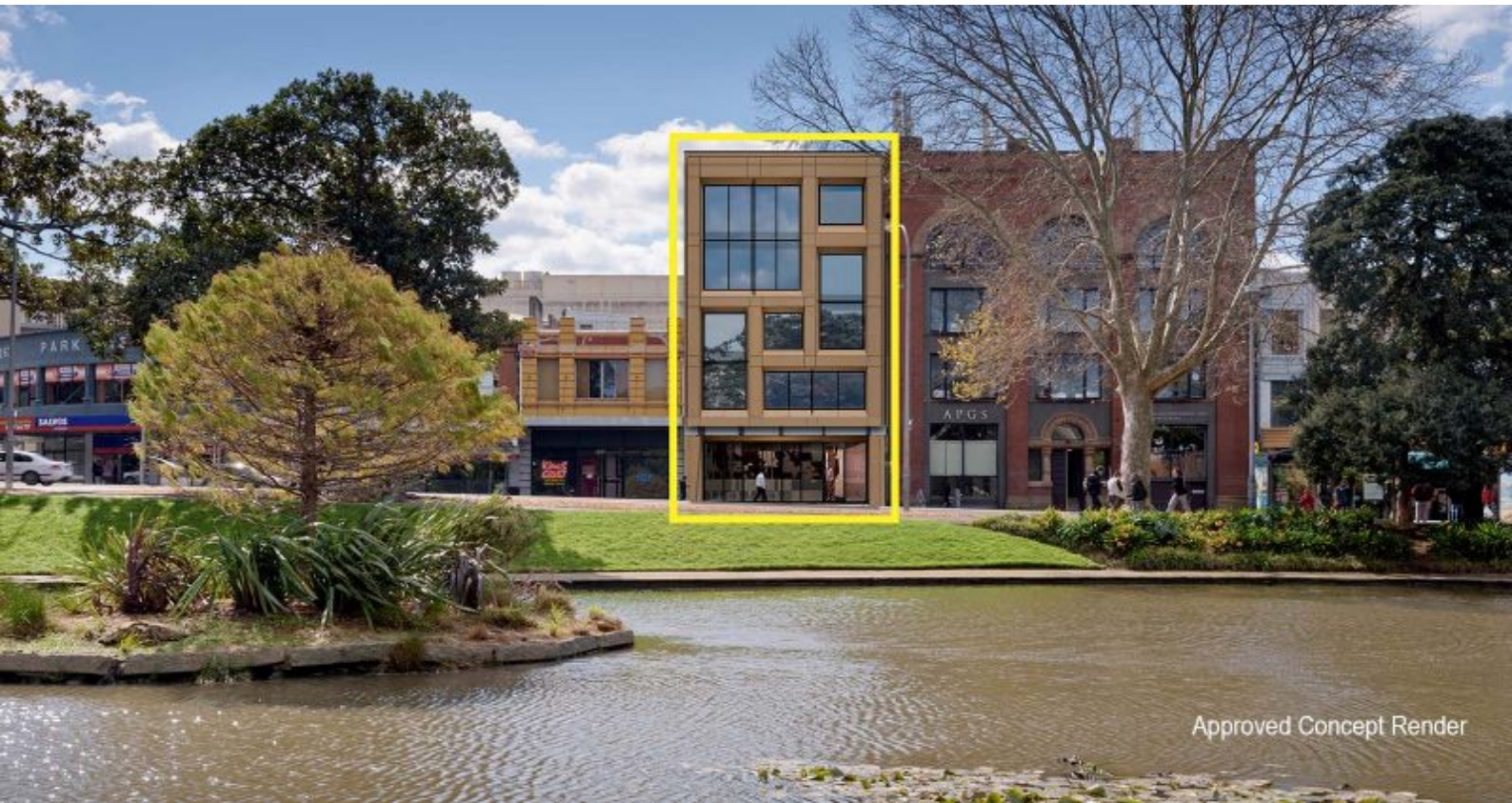
Approved Concept Render