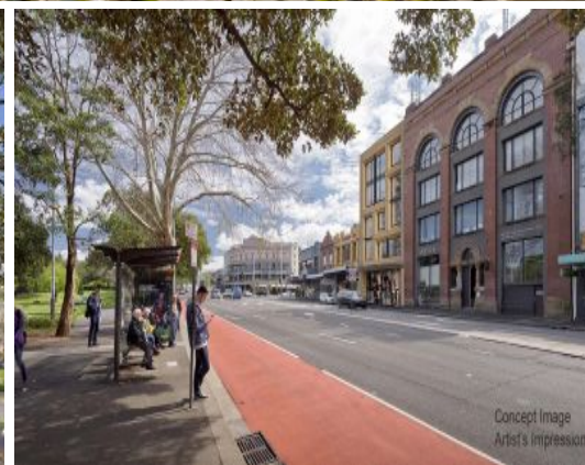
Concept Image Artist's Impression