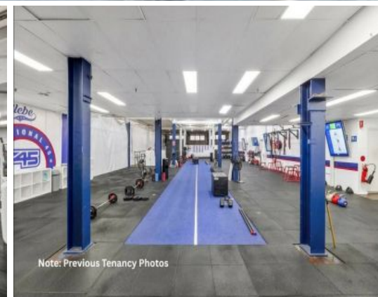
Note: Previous Tenancy Photos