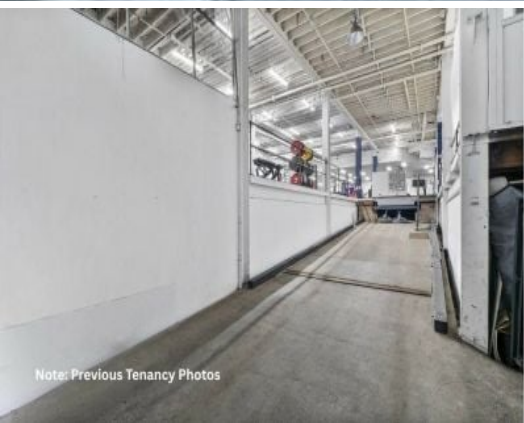
Note: Previous Tenancy Photos